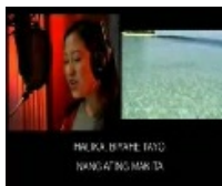
Halika! Biyahe Tayo!